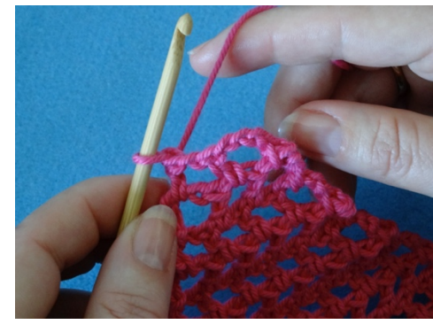
9. Turn and repeat this last row until you only have 2 chain spaces in your row.