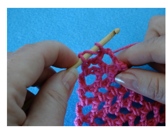
11. Make 1 treble in next chain space.