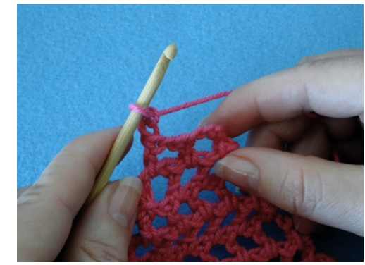
10. To make the point on the last row, make 2 chain.