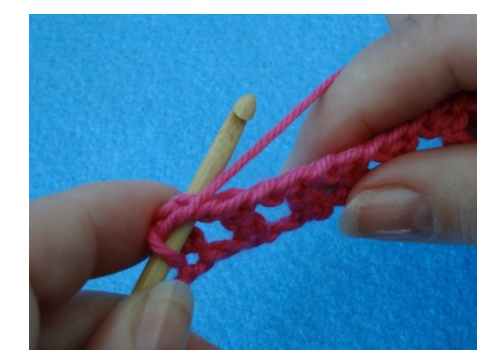
4. Turn and make 1 slip stitch into the 1^{st} chain space.