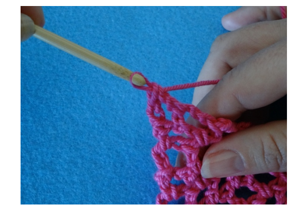
12. Fasten off, carefully pulling the yarn away from the point. Darn in ends.