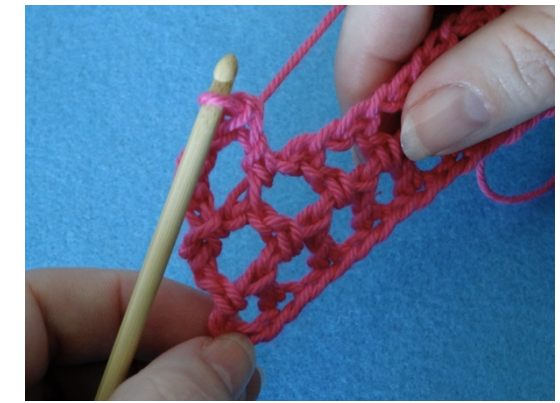
8. Following rows – Turn and make a slip stitch in the 1<sup>st</sup> chain space as before, then make 4 chain and 1 treble in next chain space. * Now make 1 chain and 1 treble in next chain space to end. This row will gradually get shorter.