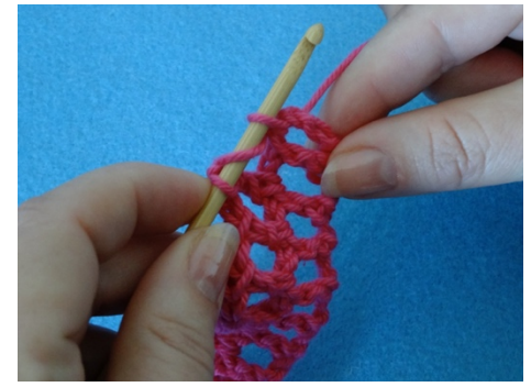
6. Make 4 chain (this represents your 1<sup>st</sup> treble and 1<sup>st</sup> chain of the row), continue making *1 chain & 1 treble in next chain space*, repeat ending in the last chain space.