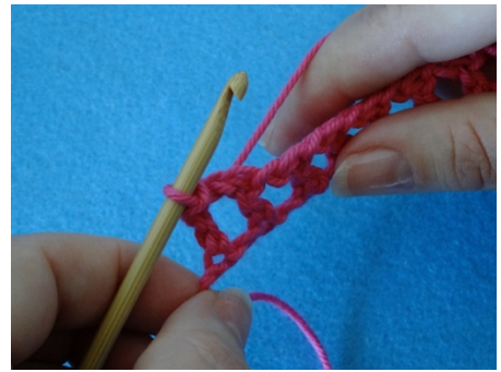
5. This will make the bunting narrower, with each row and naturally create the shaping.